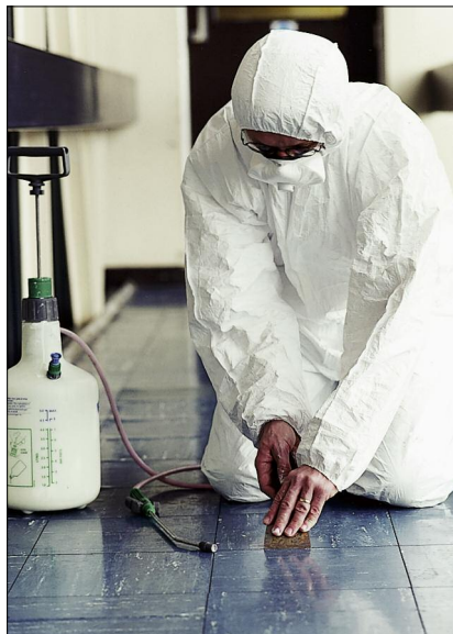
Spray at low pressure; high pressure spray could disturb fibres from asbestos paper under these tiles