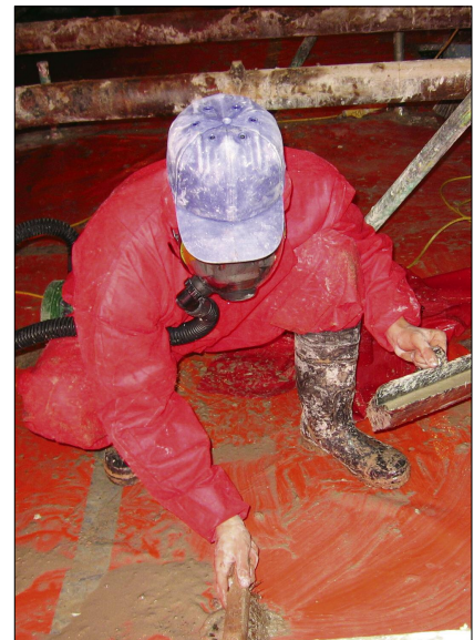
Over-wetting the material creates a waste slurry which will be difficult to clean up

This guidance is issued by the Health and Safety Executive. Following the guidance is not compulsory and you are free to take other action. But if you do follow the guidance you will normally be doing enough to comply with the law. Health and safety inspectors seek to secure compliance with the law and may refer to this guidance as illustrating good practice.